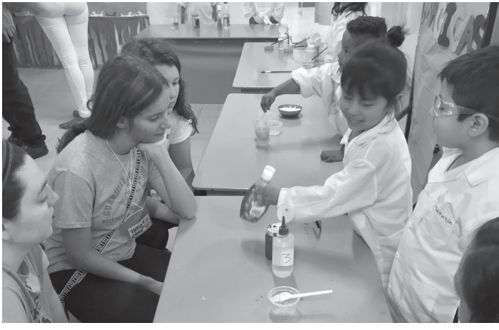
Our students excitedly presented their end of year projects with confidence and poise with topics ranging from mitosis and meiosis to local foods from various provinces.

With tours through our technical education school, open house visitors "tried their hand" at sewing, carpentry, and beauty. Metal figurines adorned the metal mechanics shop, and the Center proudly presented our plans for our technical education high school degree next year!