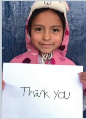
March is Women's History Month, and March 8th is International Women's Day. Thank you for supporting our girls and women. Your gifts help us bridge the gender inequality gap!