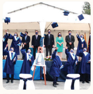
Celebrated our first-ever high school graduating class