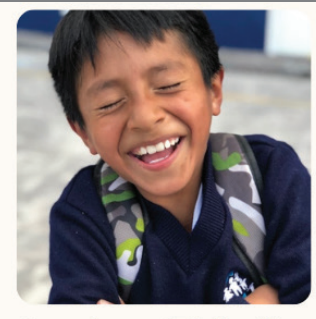
Served over 150 families with four early childhood development centers in the community