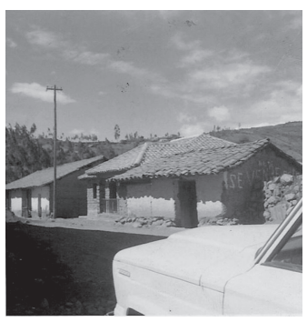
God bless us with a church