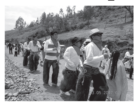
Celebrating our new road - paving not quite finished.

even in the outskirts. Two story structures along very passable roads, pick up trucks