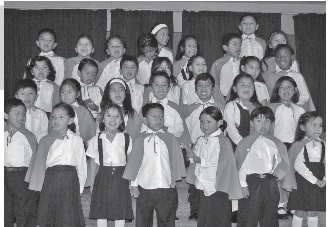
30 kindergarten students proudly display their graduation gowns at the latest Working Boys' Center graduation.

The Working Boys' Center kindergarten is on the cutting edge of preparation for the battle of good against evil. You can hear the marching music of onward Christian Soldiers when you look at their pictures. In one picture their brave red shields proclaim they are an elite corps ready for action in the face of challenges on all sides. From the looks of it, one woman for every two men is the new take on what it takes. She takes center stage and says: "Show your stuff. Practice the values you learned in pre-school." The stalwart guy on the left says: "Stomp! Don't step through the obstacles." The round-shouldered power plug on the other side of her says: "Friends united build all of it right." In the other picture, the whole graduating class gathers for one last picture of their whole force.