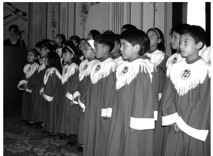
They can't believe they won!