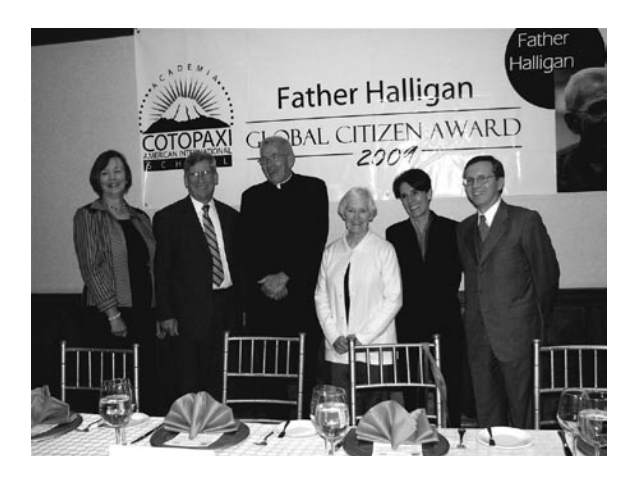
THE GLOBAL CITIZEN AND HIS COURT OF HONOR

But we at the Center think that the more important aspect of the honor is the recognition of this person who has been convinced, from the beginning of his mission, that the future of any society lies with the family, especially the family that is teaching its children, from young ages, that work is a value, not a