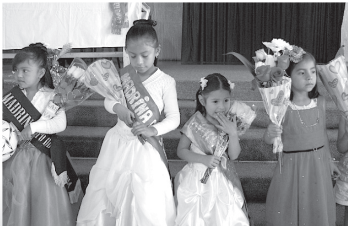
See why we couldn't pick just one winner.

December 5th, 2014 was the date on which our 50th started with our big birthday party that took months of preparation and then some recovery time. Later in December, Jesus's birthday celebration had some things old and some things new in our annual re-creation of the scene and reenactment of performances of the Bethlehem event as Jesus re-lives it in the Center. Then, all during January we had scheduled planning meetings about anniversary events to come. Now, during February and March and maybe into April, the first of those big events is screamingly underway. It's the 50th Anniversary WBC Grammar School Soccer Championship. Soccer