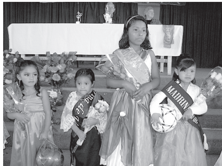
We know that God is in charge and we're grateful.

Those ceremonies are not simply parades with music, carrying huge signs with the names of the teams, speeches about sportsmanship and a final solemn declaration: "We declare the games inaugurated and we ask God to help our opponents accept crushing defeats with appropriate humility and no hard feelings."