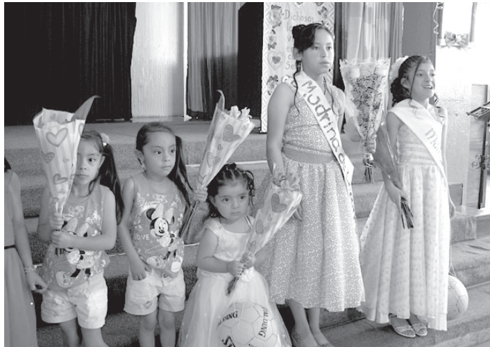
Some of the princesses.

Working Boys' Center is determined to ring all the changes possible on our victorious completion of 50 years coming alive each day to meet the sun coming up for us. This means we can't just be here. We have to use our imaginations and be into something special every day to show gratitude for this Family of Families God has kept going.