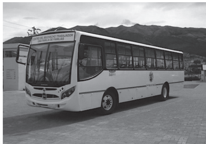
Our "flamante" new Bus