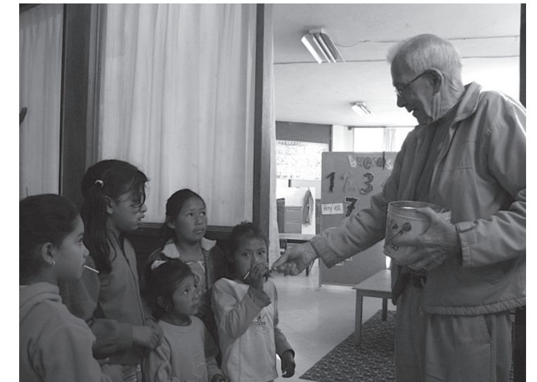
Lollipops are the reward for a work well done.

Obviously our kids have shed any mentality of oppressed poor and each of them plans to live a life of his or her own. They are just the crowd Christ will reward you for introducing to Him.