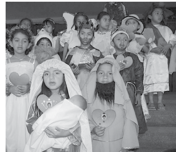
Our hearts belong to Jesus.

The first graders can’t be completely left out. So, on the Saturday just before