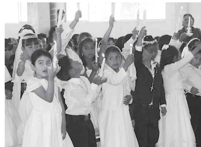
Welcome to Jesus, Light of all the World.

All year long, overseas missionary groups from parishes and schools are enlisted in the sorting of donated used clothing so that each family gets a big bundle of usable items at Christmas. A great part of the clothing is new and unused, carried in by our visiting groups. So the ritual of “Christmas Bundles Day” is by no means a minor event. I don’t think God would ever put the folks to the terrible test of choosing between celebrating the baby Jesus or their Christmas clothes bundles.