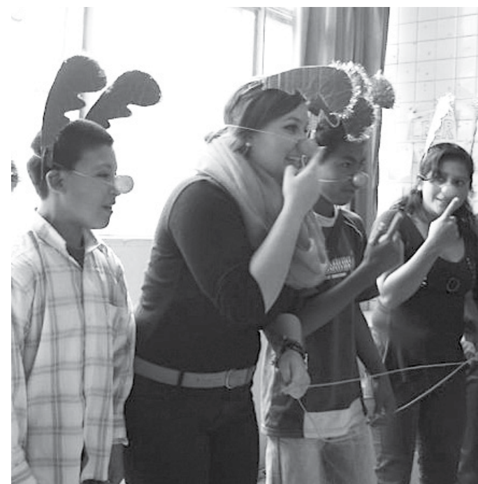
Everyone wants to play Rudolph in the Special Education group.

Also from the start of the school year, our yearlong USA volunteers create theater