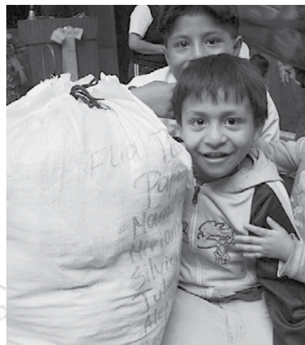
A bundle with something for everyone in the family.

Those celebrations are not just one big blast on Christmas Eve and Christmas Day. The kids’ choir starts practicing in September. The adult choir starts in October.