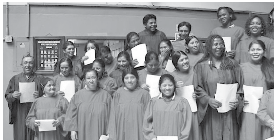
“Joy to the World” our adults sing out.