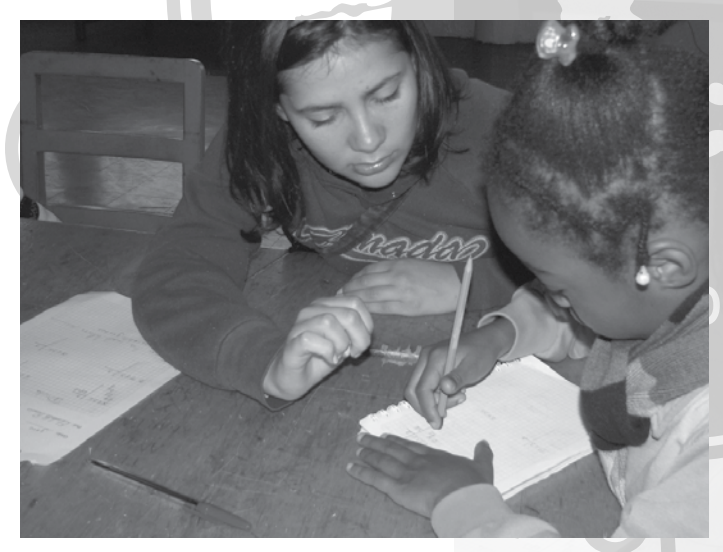
Even the teenagers learn to give back by helping the grade schoolers with their homework.