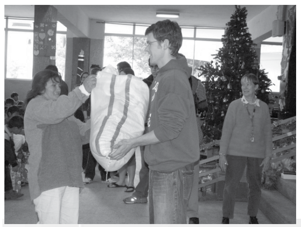
Benefactors' generosity makes possible the annual giving of Christmas bundles to each family.

Anyone who does not know the Working Boys' Center would have to wonder what fun there could be in reforming a whole life style that did not include studying, bathing regularly and making and keeping a budget with the objective of using the savings to build a "house" which is not a "room". These are all obligations that would seem to oppress them into self pity. But all the evident rooting for each other that drives the Center onward is the new game of life as God intended it to be, and as Jesus finds us at Christmas.