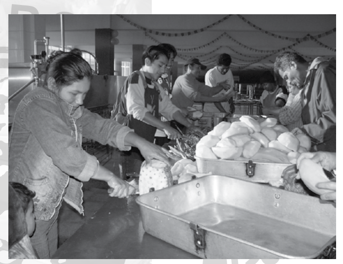
The "Volunteerism" program is the families' way of giving to each other.